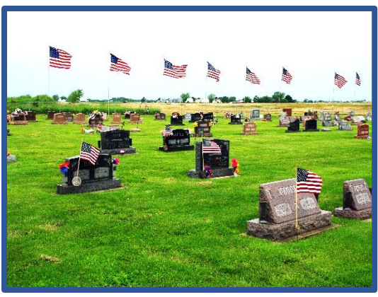
Photographs show the 63 Circle of Flags as well as some of the 93 flags placed at each grave