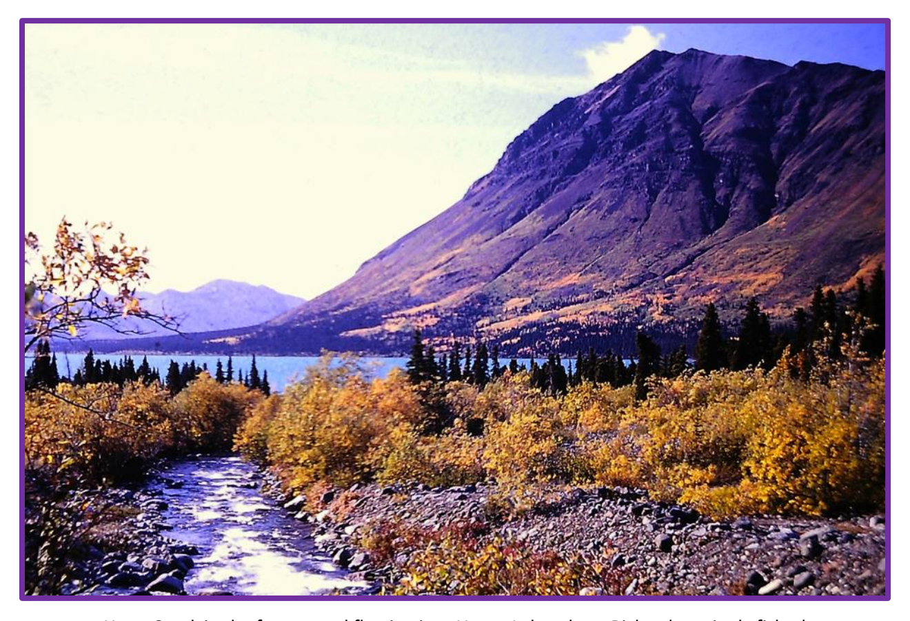
Hope Creek in the foreground flowing into Upper Lake where Richard routinely fished