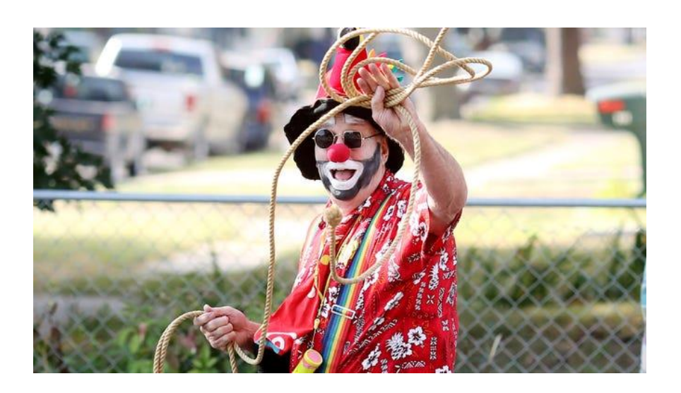
SHOELOOSE, THE GRAND MARSHALL OF THE 2022 RODEO PARADE