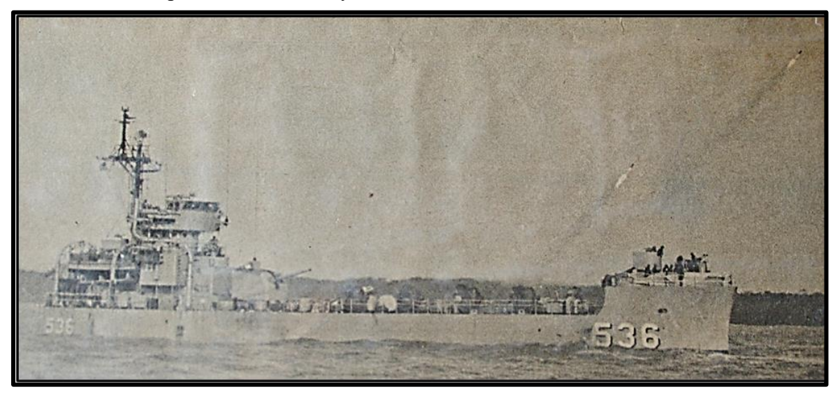
The photo above shows the USS White River on duty in the South China Sea. Notice the two rockets fired over the ship's bow.

To the enemy attempting to infiltrate South Vietnam from the north via routes along the coastal region of I Corps and their Viet Cong counterparts entrenched in the swampy area IV Corps, there was a ghost haunting them from the South China Sea with a rain of terror and destruction. Chugging up and down the coast of South Vietnam, the Seventh Fleet rocket-firing ship USS White River (LFR) looked like a harmless vessel carrying out harmless missions. But, the "White River" had the fire power of six destroyers.